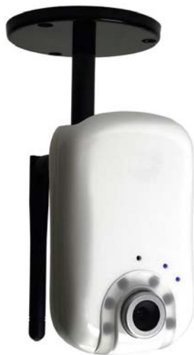
Shown with ceiling mount bracket