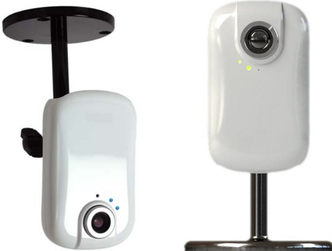
Shown with ceiling mount (left) and table mount (right)